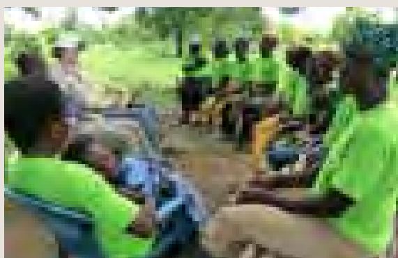
Image 3: Focus groups in Yindure (top), Wakii (centre) and Tongo-Beo (bottom)

Key informant interviews were held with people in key positions in the community to gain deeper understanding of changes, stakeholder participation and different perspectives they may have.