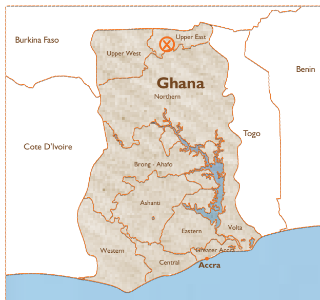
Figure 1: Project location on map of Ghana

A summary of outcomes for the nine participating rural communities is represented in Table 1. A more detailed breakdown of outcomes can be found on page 18.