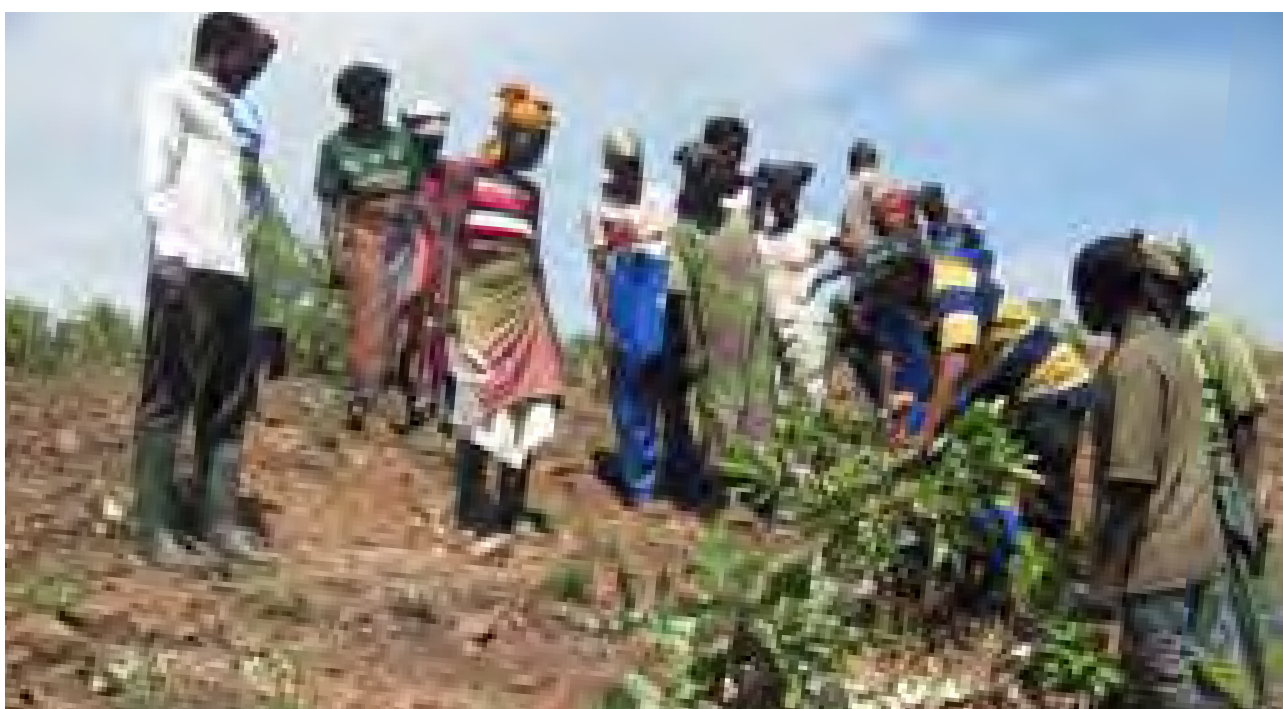
Image 9: Yameriga: In year 1, World Vision staff demonstrate the FMNR pruning technique