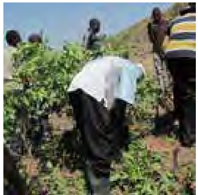
Image 12: Yameriga FMNR members and World Vision staff pruning in year 1