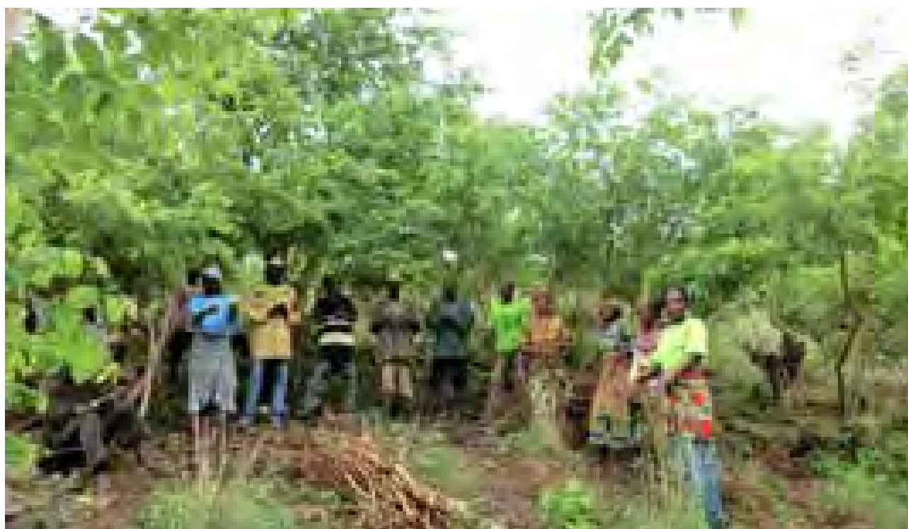
Image 10: Wakii village: Lead group members shelter from the sun in the community-managed FMNR forest site

FMNR is often promoted for its ability to provide rural communities with timber and improve arable soils. In this study, FMNR's contribution to livestock health, psychosocial wellbeing and household access to "wild" consumables such as indigenous fruits, traditional remedies, bush meat and construction materials (thatching and rafters) also created significant value. Yet, because these benefits are not easily measured in economic terms, they may have been invisible or under-valued in previous studies of FMNR compared to more tangible outcomes such as provision of firewood, soil improvement and crop protection.