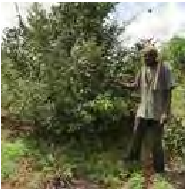
Image 11: Yameriga farmer shows off FMNR regrowth beside his field

The project and this SROI report were made possible by co-funding from AusAID and donations from the people of Australia.