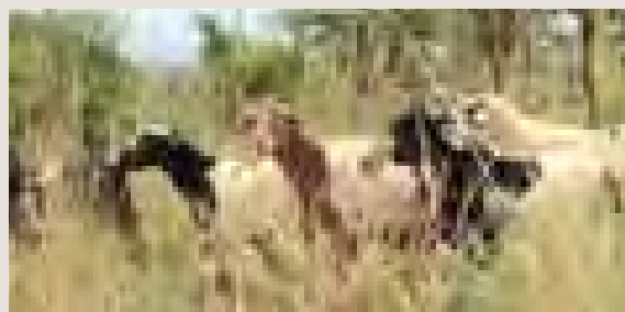
Image 6: Wakii village: Goats benefit from perennial grass supply due to FMNR sites and elimination of burning