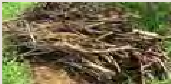
Image 4: Yameriga village: Firewood is bundled next to one-year-old regrowth in FMNR forest

The findings highlight that although FMNR is often introduced on the grounds of improving arable soils and crop production, these gains were secondary to the value of natural assets and availability of consumables enhanced by FMNR.