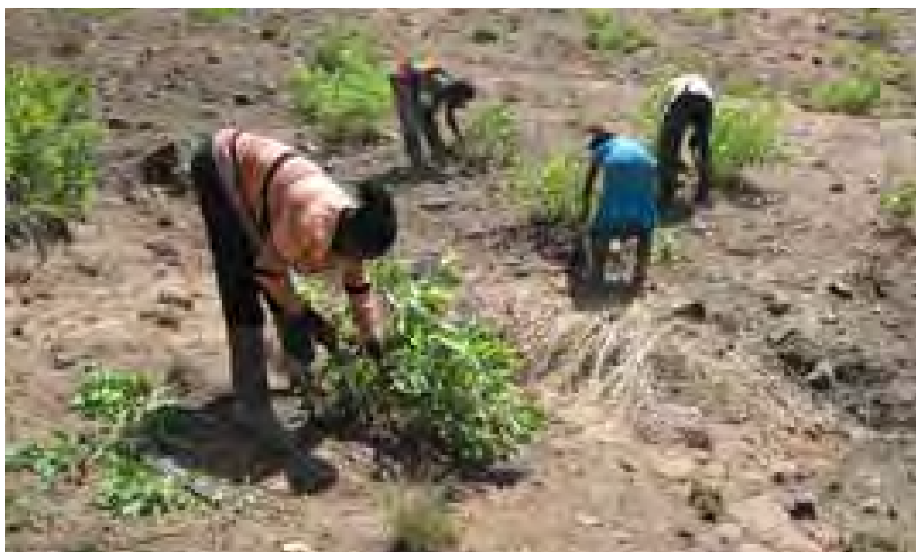
Image 8: Wakii FMR group members selecting and pruning regrowth at the project initiation

Given the above, “it is misleading to compare the efficiency or effectiveness of organisations based on the SROI ratio: it is critical to understand the model, the story of change, and the judgements that underpin the SROI ratio before a comparison could be made” 14 .