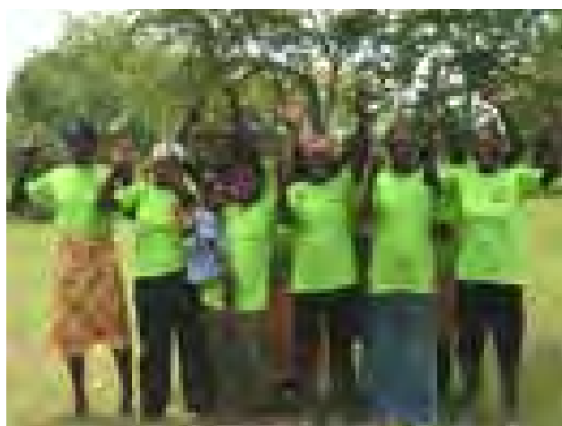
Image 2: Tongo-Beo village: Lead FMNR group women in front of several copses after two years of FMNR regrowth