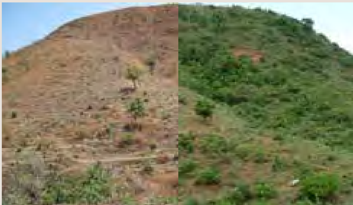
Image 1: Community-managed FMNR site in Yameriga: at baseline and end-of-project